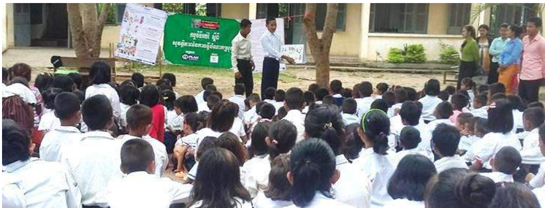
Peer education-Peer conduct school awareness raising