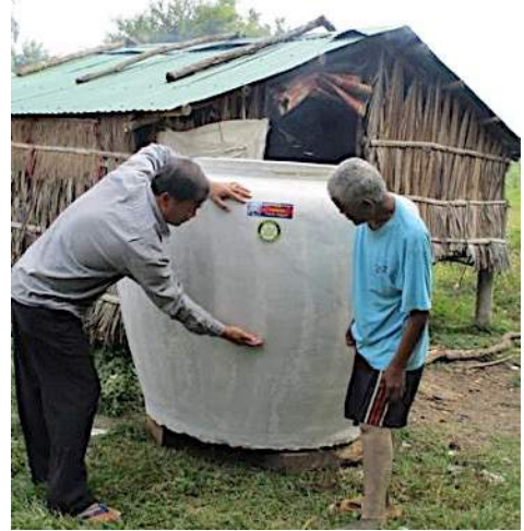
Rain-water jars installed for the poor