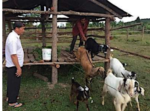
Goat Raising (a trial initiative)