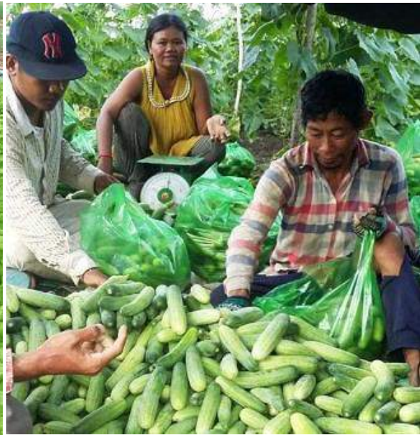
Vegetable market garden