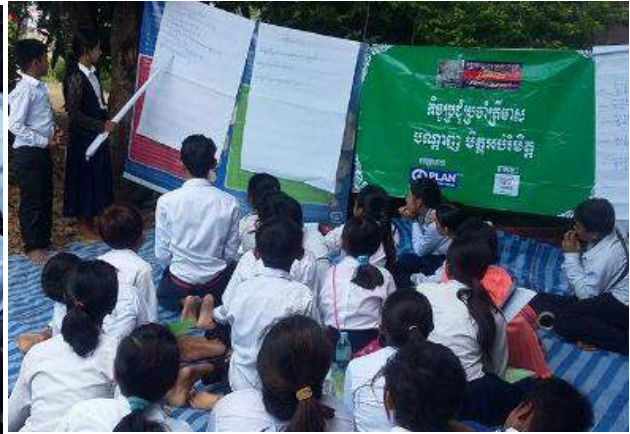
Peer to Peer training by students in government schools