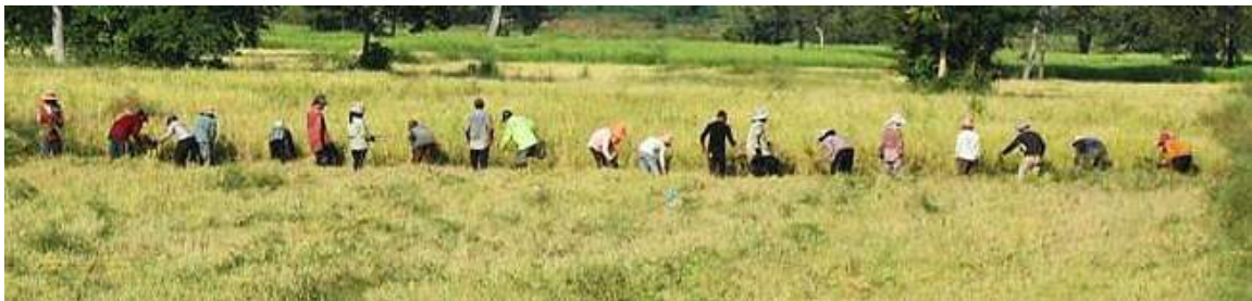
Promote community working together and helping each other