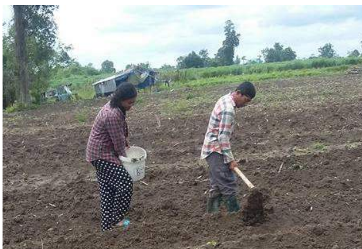
CFS provided capital to start their income-generation