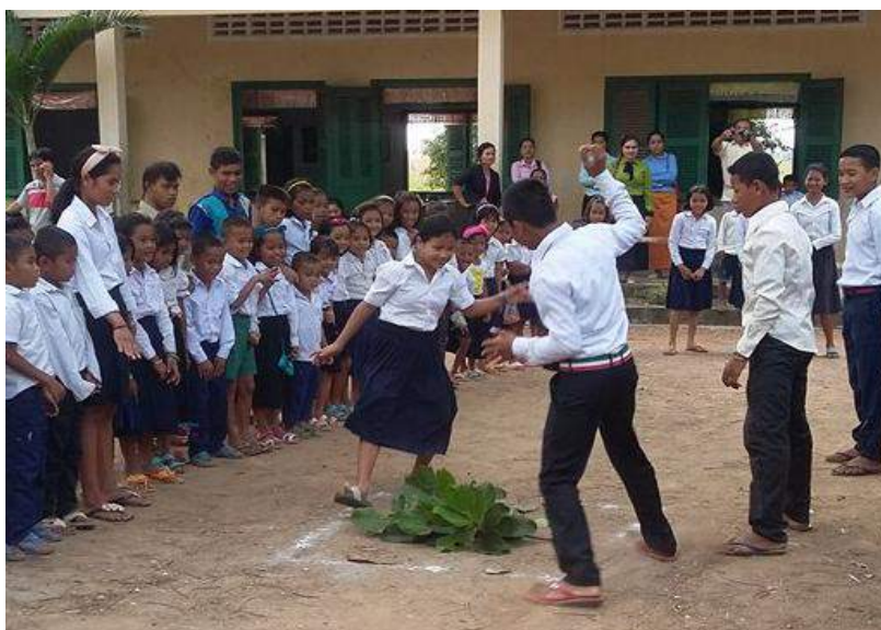
Traditional play to promote school attendance