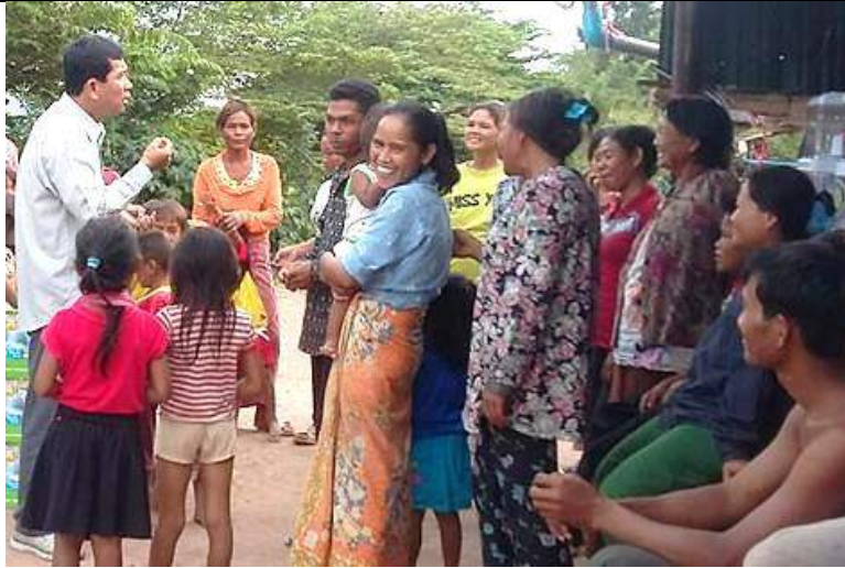
Promote community working in Self Help Groups