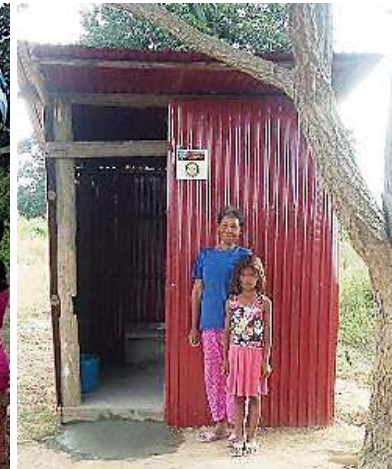
Community helping together to build their own toilets