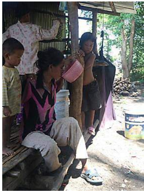
Teaching the importance of good sanitation and hygiene