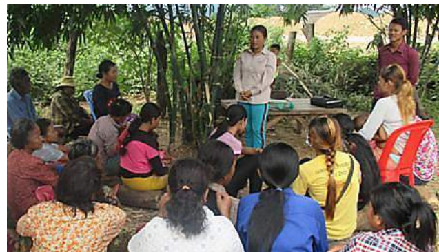
Self Help Group Meeting and Savings