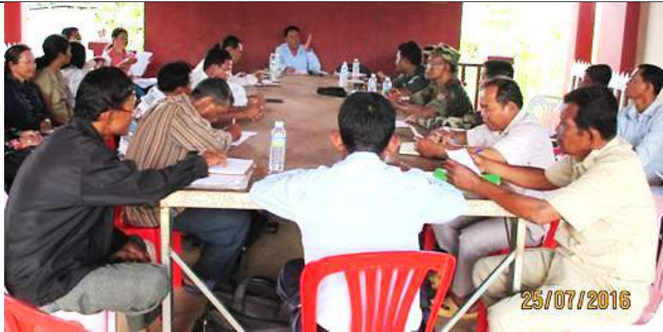
Meeting with local leaders/CCWC to address children's problems