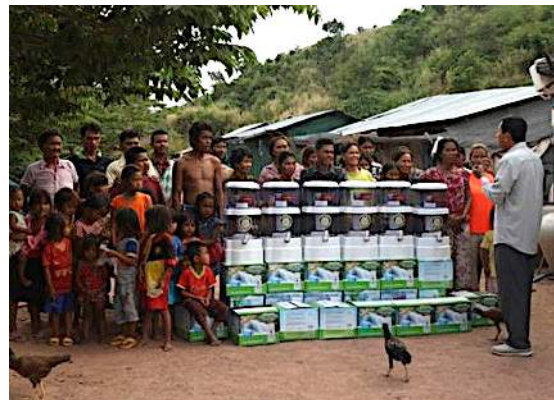
Drinking water filters provided to the poor