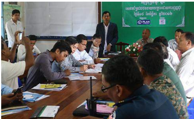
CFS conducted training to increase local capacity