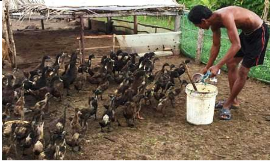
Duck and Chicken raising