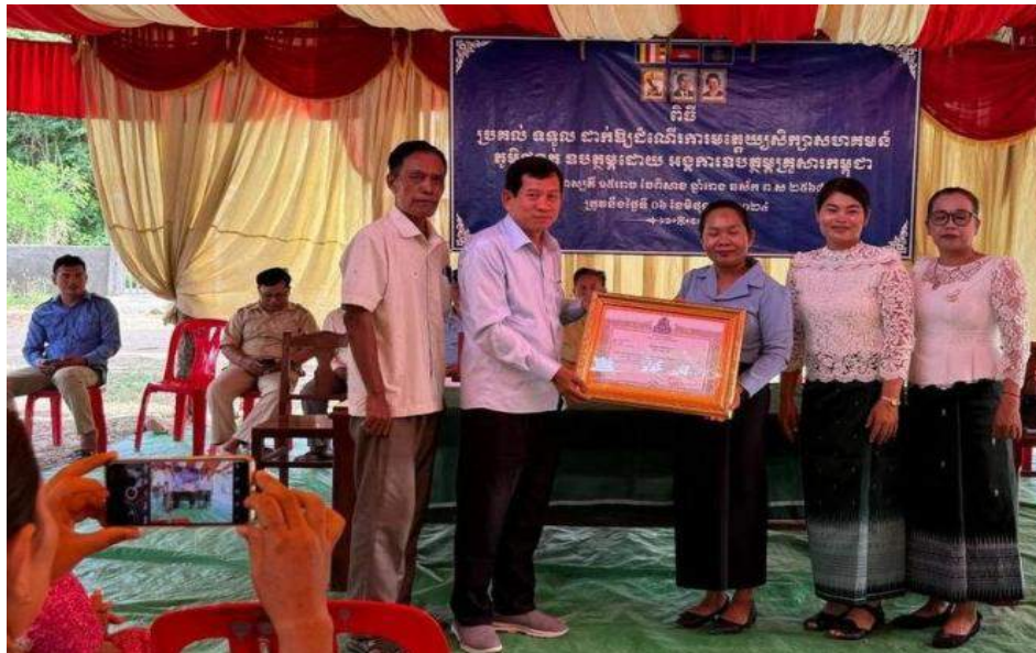
Appreciation letter given to CFS donors: