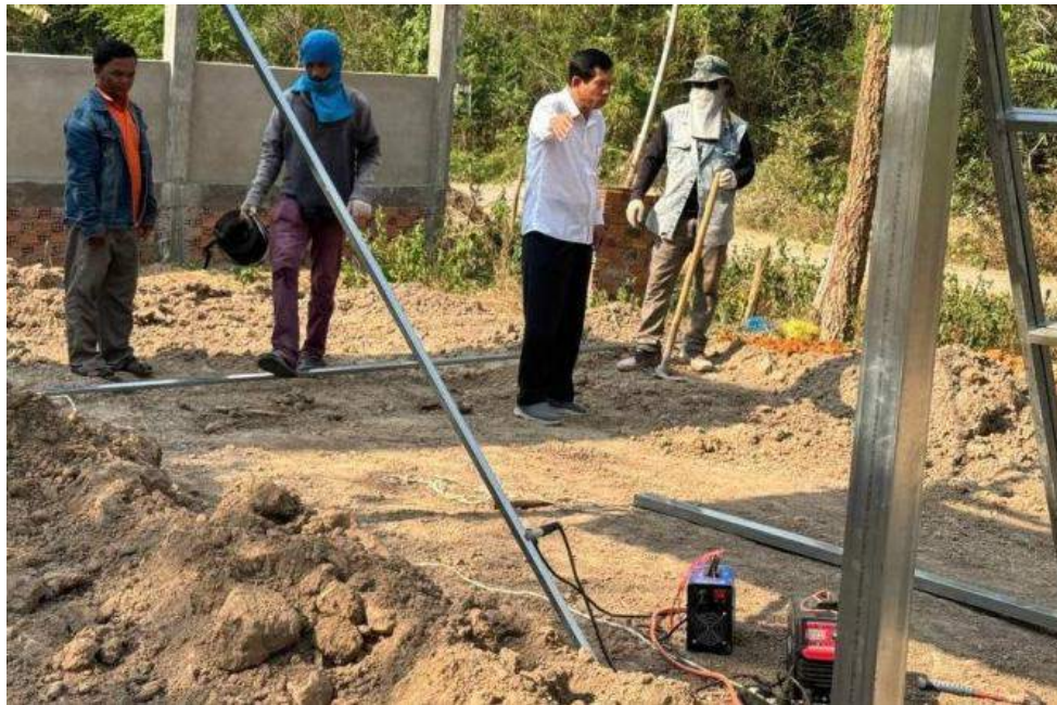
Process of building: