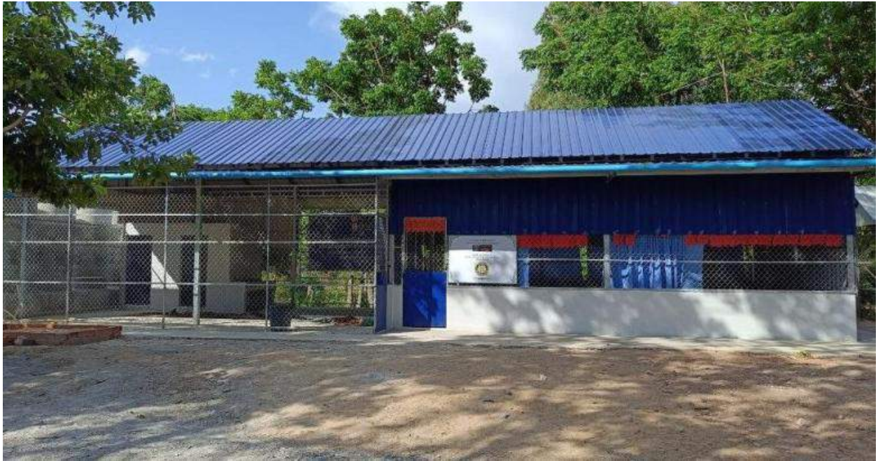
The school completely built

On behalf of rural children and as well as Cambodia Family Support (CFS) and myself, I would like to say thank you very much for very generous of you all supported this school building,