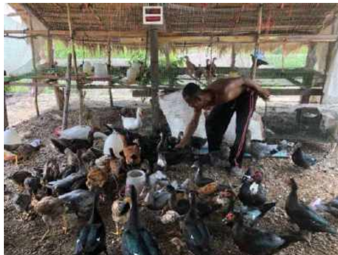
Chicken and Duck raising, supported by CFS