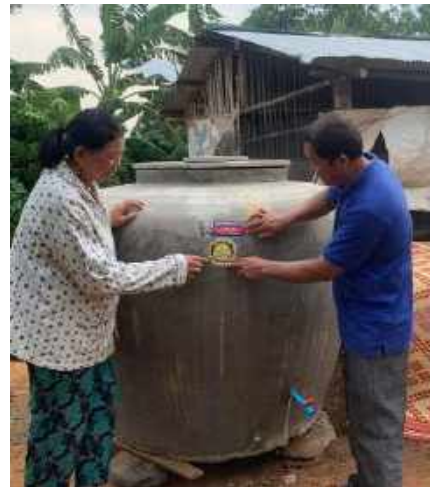
A family, before and after providing jar