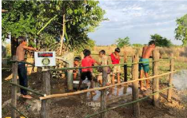
The same well after fixed

Within this reporting period, there are 11 wells were fixed in Kamrieng and Pailin. Only one well was bored in Rattanak Mondul, See picture as below: