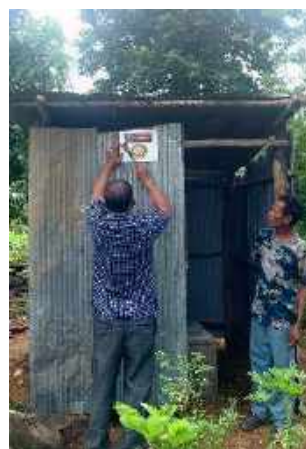
Latrine complete built