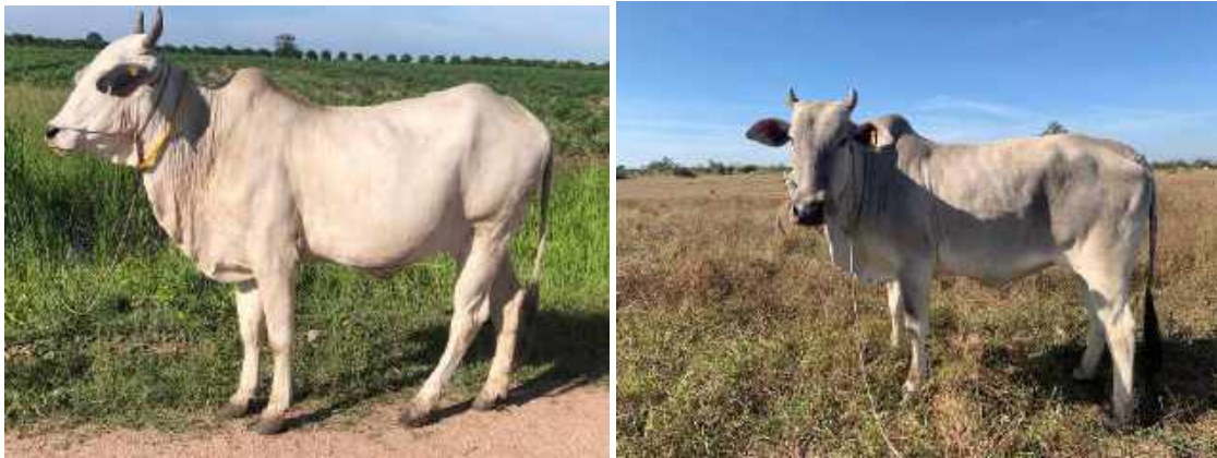
Cow raising, supported by CFS