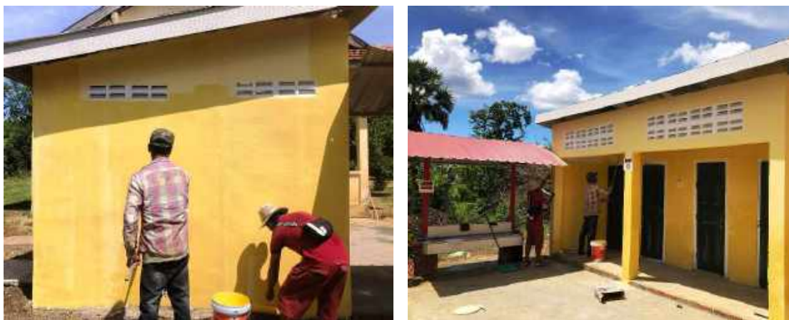
A school latrine is in the process of building