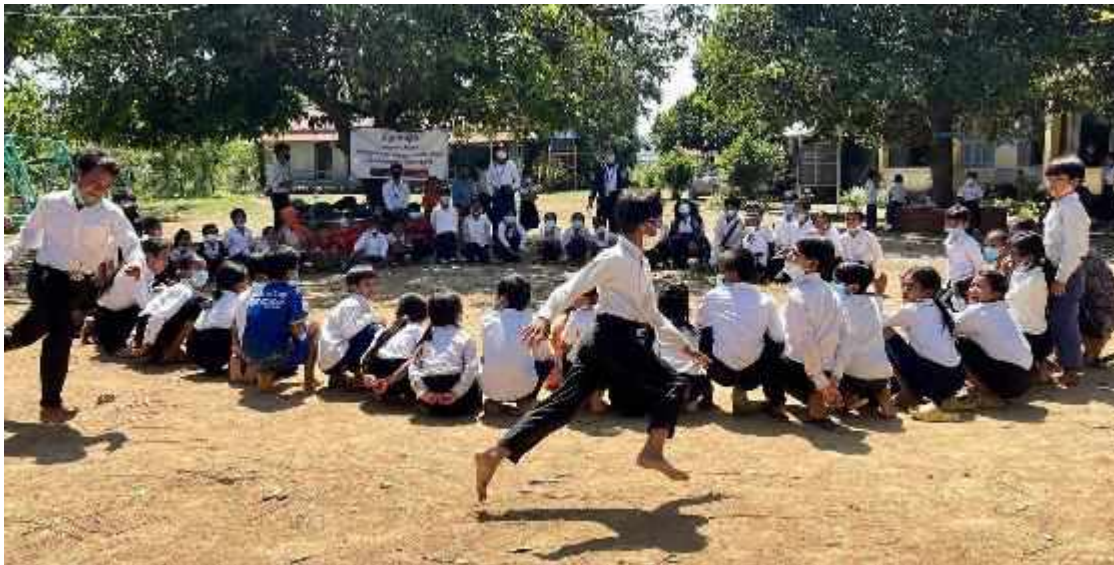
Play activity to promote school happy environment

Generally, CFS introduced traditional game for happy school environment. It was observed that children are happy during play activity.