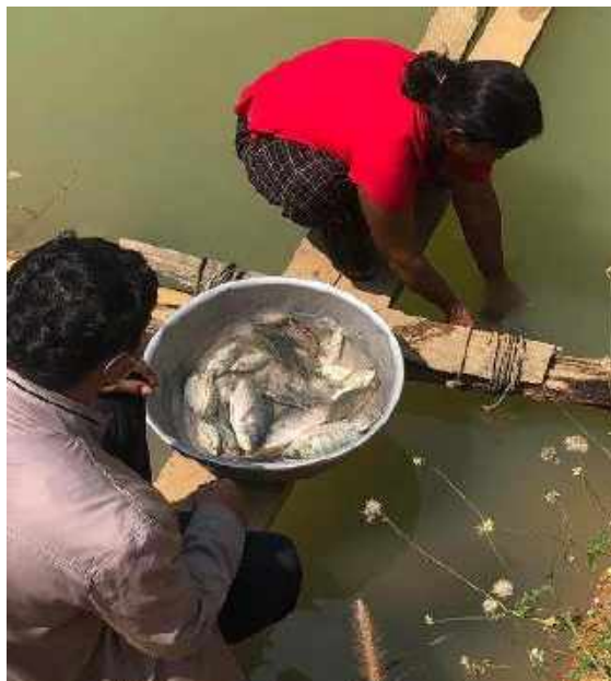
Rural poor raising fish for nutrition and income, supported by CFS