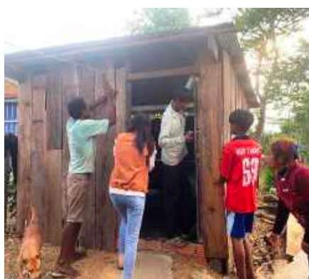
Helping each other to build