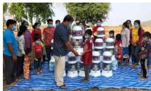
CFS-provided water filters to rural families