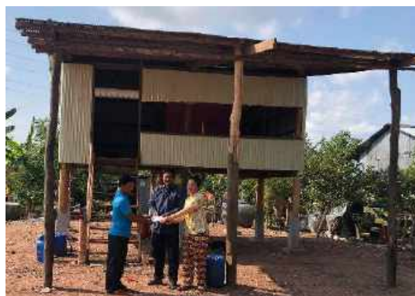
House after building