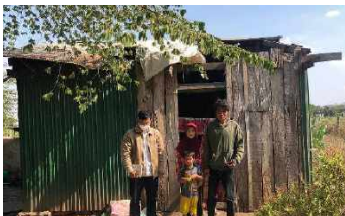
House before building