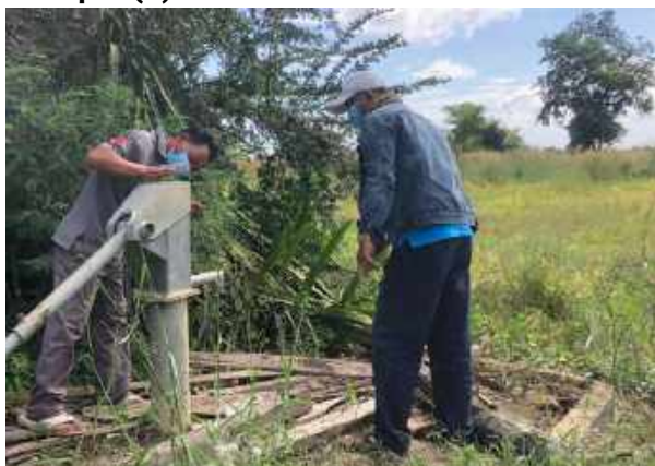
Well before fixed