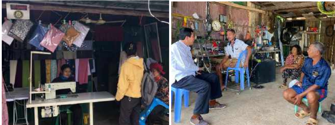
Micro-business for generating income, supported by CFS

Practical implementation has been shown that approximately 90% of rural family are interested in animal raising for additional income and for nutrition. Raising chicken, duck fish, frog, goats, piglets and cows were supported by CFS. Below are some pictures of animal raising supported by CFS in helping poor families to generate income: