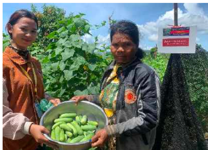
Vegetable market garden