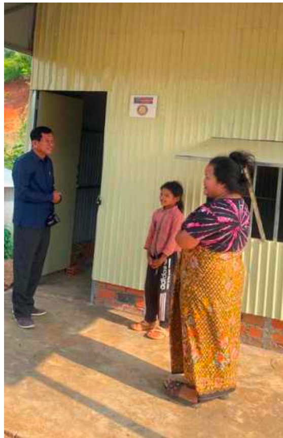
Their new house building supported by CFS