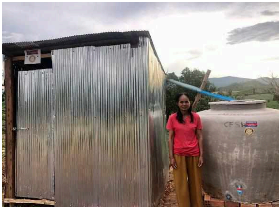
Latrine, supported by CFS