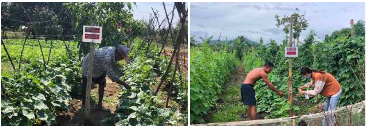
Vegetable market garden