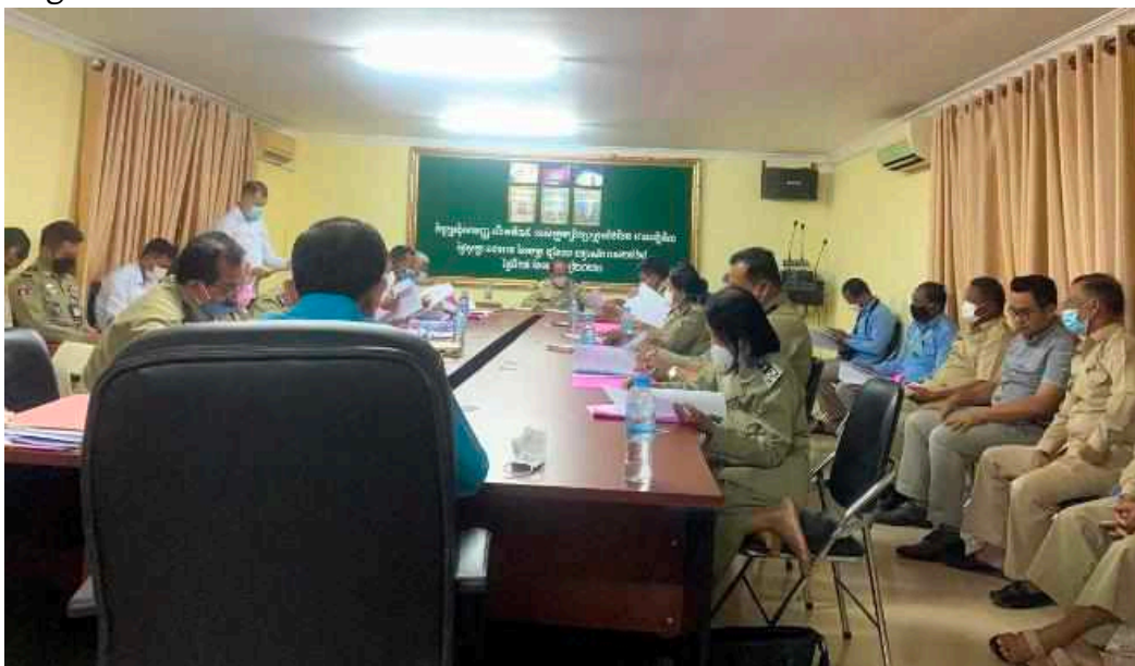
CFS-attended WCCC or CCWC monthly meeting

CFS remain support WCCC meeting. We attending as a technically supporter, facilitated to enabled them to raise women and children related issues and support further actions. Women and children related issues raised during meeting will formulate into a plan with timeframe for conducting family visit. According to the problems raised in the meeting, as soon as possible CFS collaborates with WCCC member conducted home visit in order to understand of the problems. Generally, women and children's problems are solved through this commitment. Below, here is picture of CFS with WCCC meeting.