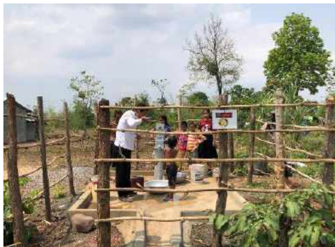
Community children are using well after digging