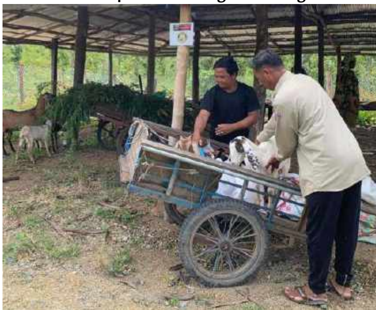
Goats raising supported by CFS