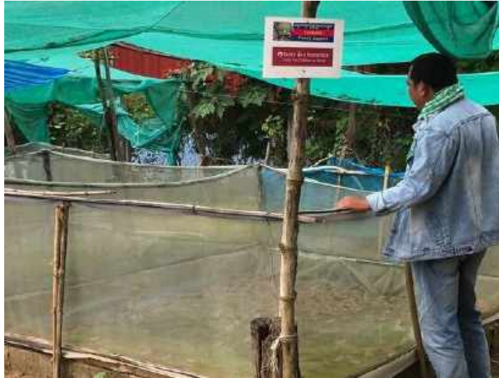
Frog raising, supported by CFS