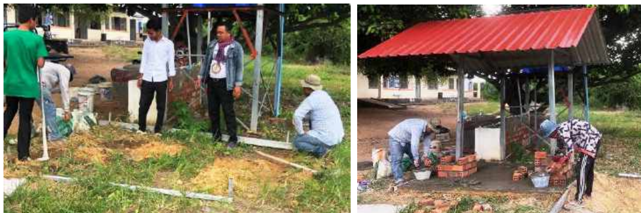
School handwashing in the process of building

It is to report that from Aug-2021 to Jul 2022, CFS built three school handwashing. These three school handwashing were built in Kamrieng. See some picture as below: