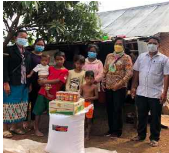
Food given to poor parents who has identified, shortage of foods for their children