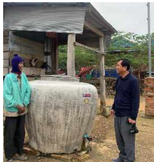
A family, before and after providing jar