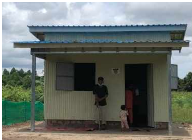
The family is very happy to have new house.