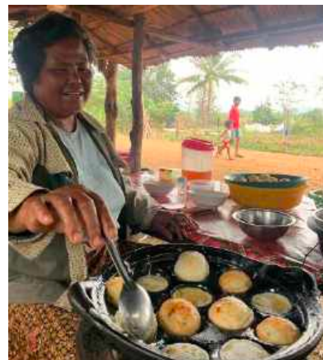
Income generation activities, supported by CFS