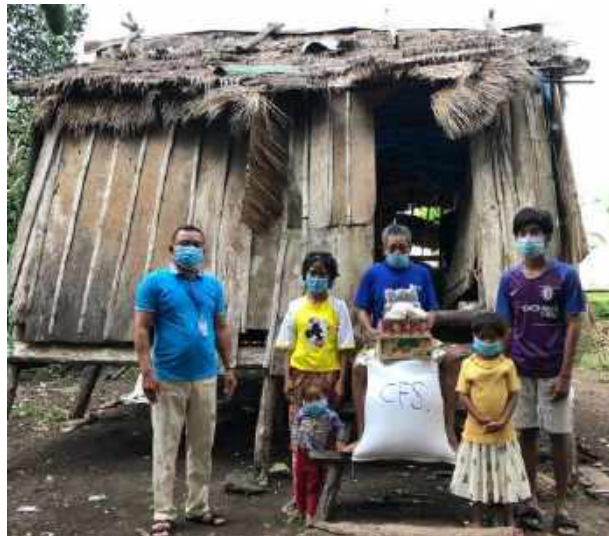
A poor family who need new house

Here are some pictures of house building: Example (1)