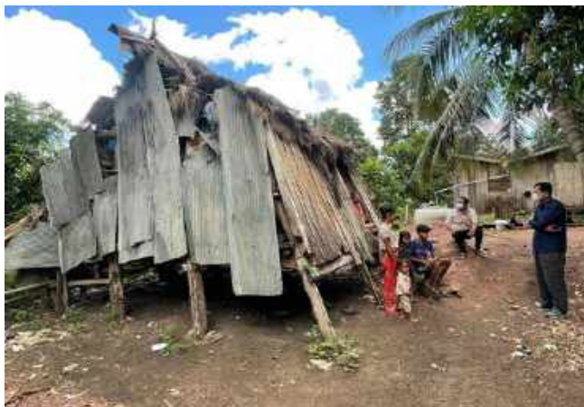
Their house before getting assistance