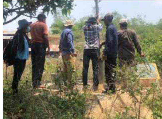
Well is fixing