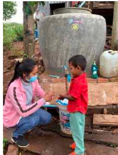
Helped each other to putting big jar