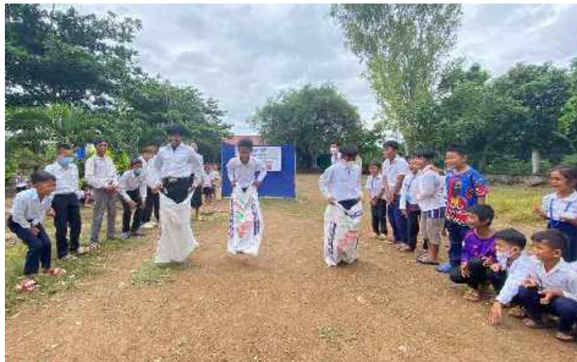
Play activity to promote school happy environment

Additional to ongoing education, CFS provided schools and communities with material assistance including big jar (1800liters) for storage rainwater, water filters for filtration water for drinking, toilets to participate with Cambodia-Government to end open defecation as committed. In addition, CFS helped villagers dug ponds and bored wells, or fixed pump wells to enable community villagers in the target to having sufficient drinking water and utilization. CFS helped school-children with building school handwashing, school toilets, school water storage based on reality needs.