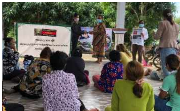
CFS-supported CWCC-WCCC conducted community awareness raising