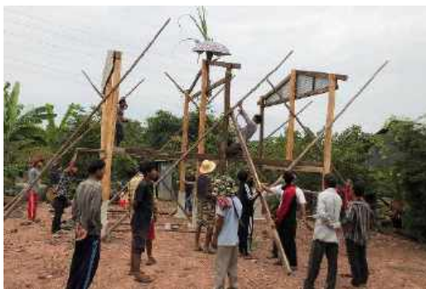
Process of house building, Supported by CFS and helping by their self-help group