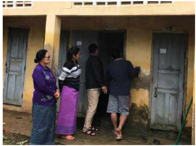
School toilet before building

The background was that, we a got a report from local school teacher that their school-latrine was deteriorated which not able to use anymore. CFS had visited and seen that this school latrine need to be renovated or build new one. After discussion, we decided to build a new one. See process picture of building as below: