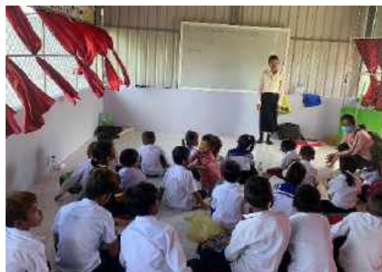
Our community children hare happy to have their education