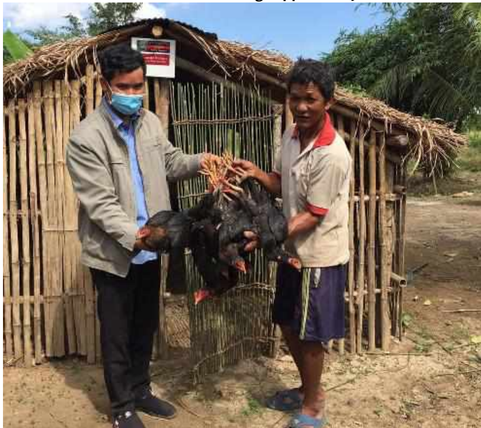
CFS supports Chicken raising