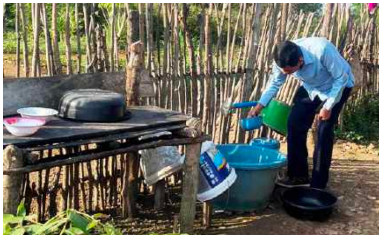
Domestic rural sanitation and hygiene

Furthermore, it was seen that some rural poor family are living without private sanitary toilets. The question is that where do the excreta of these people are going? Approximately 30% of Cambodian under five children are malnourished (CHDS-2020). More often, diarrhea, pneumonia and other respiratory infection might due to poor health, poor access to clean water, sanitation and hygiene. Medical expense while sickness caused by preventable disease is another exacerbated to current poverty. The vulnerability of children in high prevalence of water-borne diseases was remarkable by poor access to potable water and fecal waste contamination. Below, here are some pictures of typical rural practices of sanitation and hygiene.