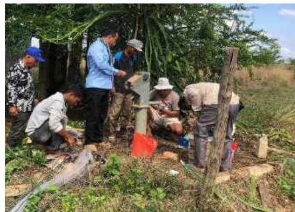
Well is fixing