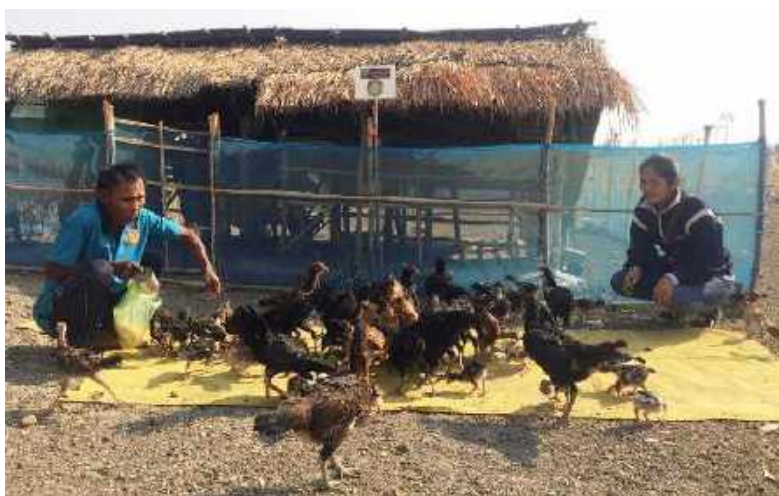
Choum Cheat's chicken raising so productive

Choum Cheat , chicken raised was so productive, so quick, he has got income by chicken raised, he told us that he used to bring chicken to sell in local market and get income for family, he said during our home followed up.