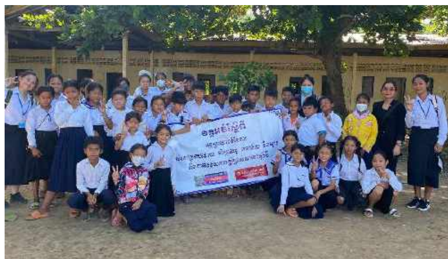
Child-Youth led school awareness raising