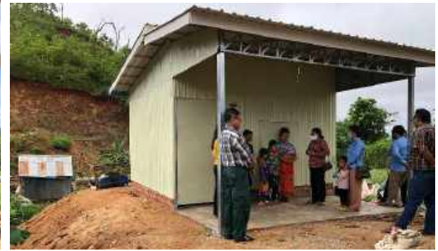
Building a house for her and her family