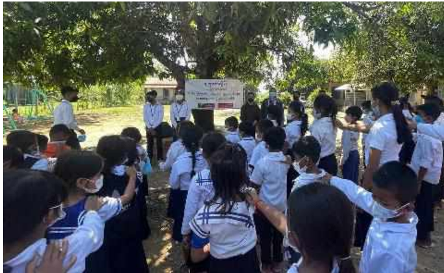
Child-Youth led school awareness raising