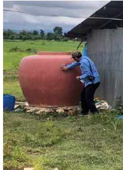
Jars supported by CFS

Here are some pictures of CFS provided water filters to villagers: