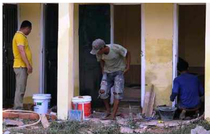
School latrine in process of building