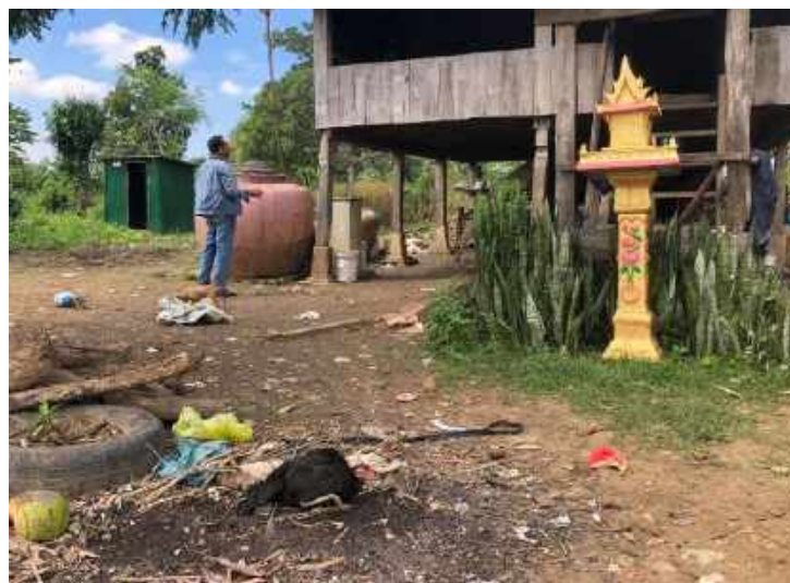
Typical pre-intervention sanitation and hygiene of a rural family

Therefore, to reduce poverty condition among rural poor, domestic sanitation and hygiene should not be negligent. That is a reason why CFS usually focus on it while we are conducting community education. Below is an example of CFS implementation to changed rural behavior in regard to domestic sanitation and hygiene.