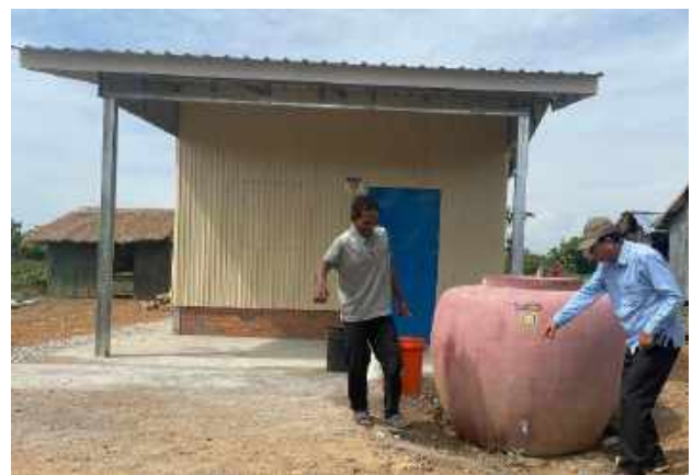
Choum Cheat's house Almost finished