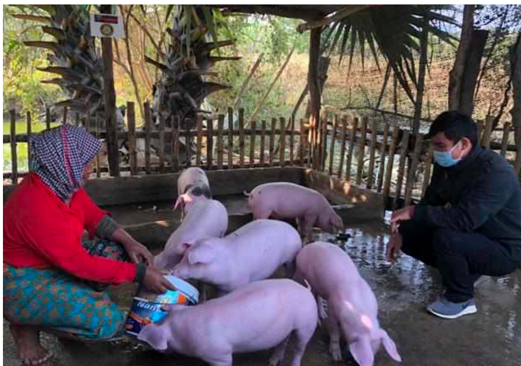
Piglets raising supported by CFS

Note: The number of complete pass on in the above table are not recorded or not under control of CFS project anymore. According to the animal raising policy; when a family got an animal from CFS, that family has to be raised for generate income and nutrition. But that family is responsible to return 2 animals back to CFS. When that family has already passed 2 animals to CFS, the first one that we gave will belong those family and not control by CFS anymore.