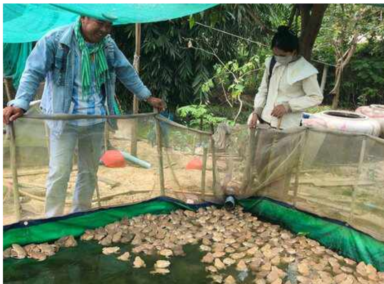
Frog raising supported by CFS