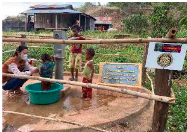
The same well after fixed