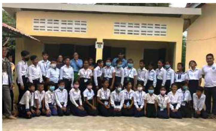
(he same school latrine is using by school children after building

It is to report that from Aug-2021 to Jul 2022, CFS built three school handwashing. These three school handwashing were built in Kamrieng. See some picture as below: