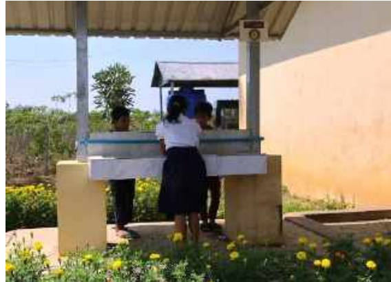
School handwashing completely built

It is to report that from Aug-2021 to Jul 2022, there is a center for education (Literacy center) was completely built. This education center was funded by private donors who are currently living in Perth (Australia). Since 2017, they have financially supported CFS to build seven communities education centers (Literacy school) included this one.