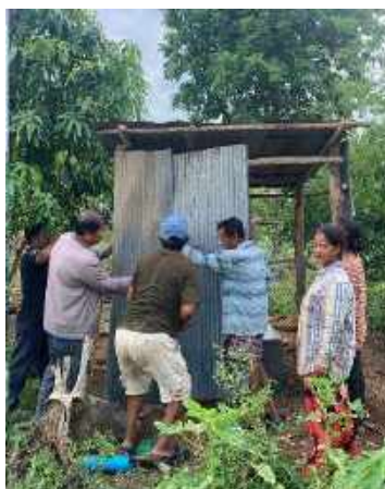
They helped each other