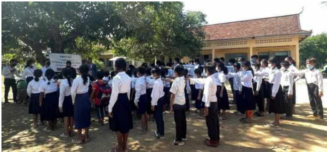
Child-Youth led school awareness raising