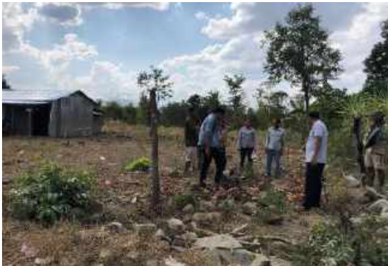
Well before digging

Within this reporting period, there are 11 wells were fixed in Kamrieng and Pailin. Only one well was bored in Rattanak Mondul, See picture as below: