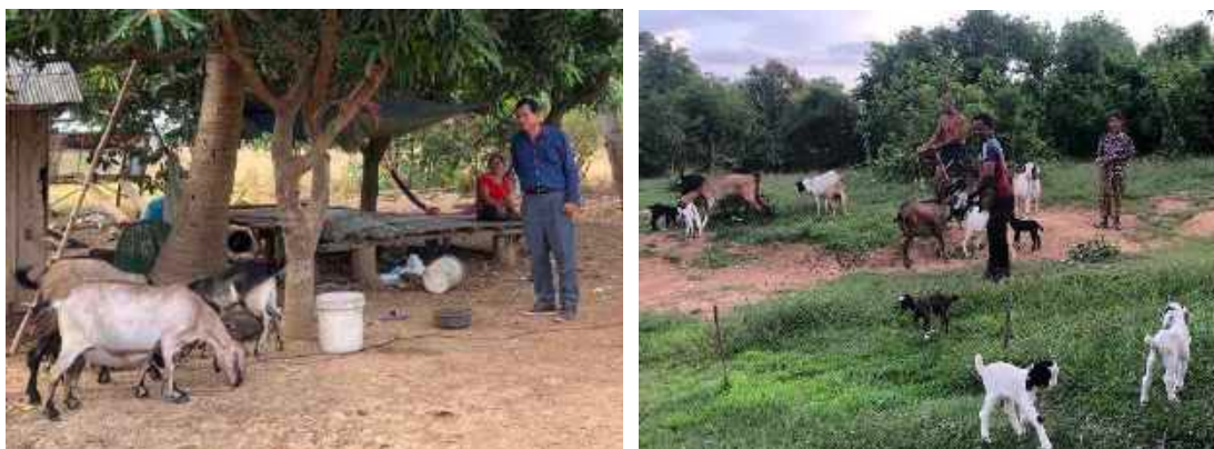
Goats raising supported by CFS