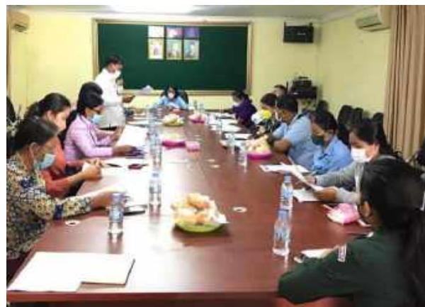
CFS-attended WCCC or CCWC monthly meeting