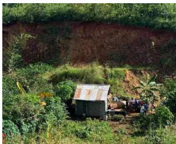
House before building