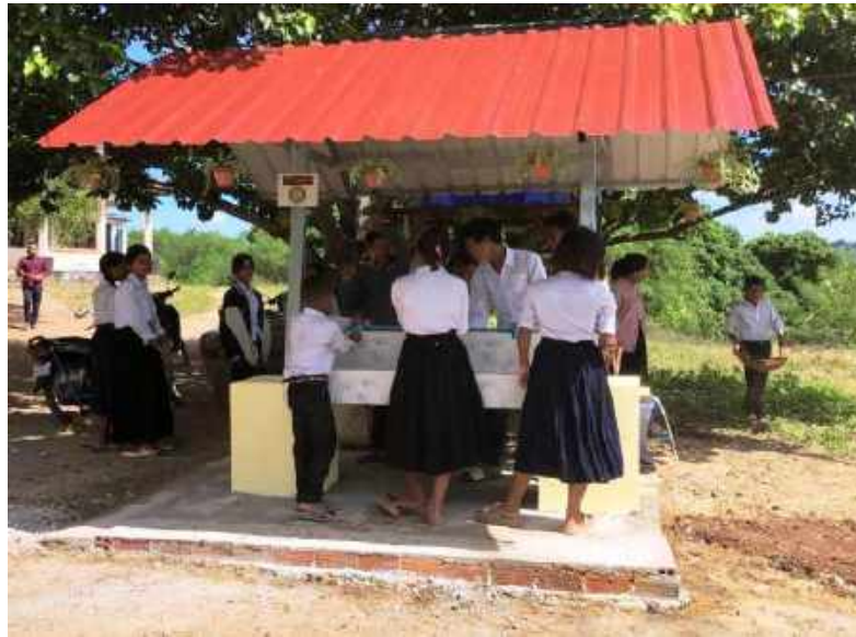
School handwashing completely built