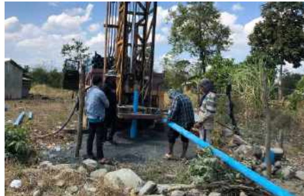
Well is digging