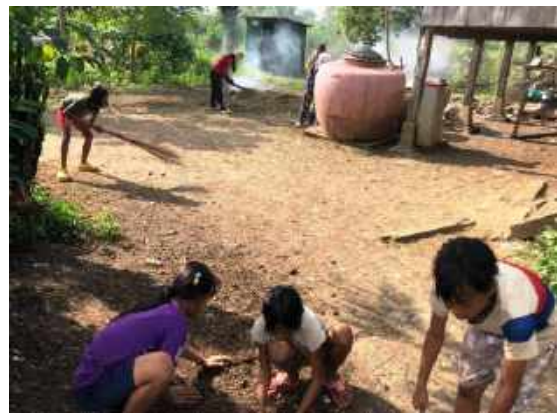
Family members participate in cleaning their home environment