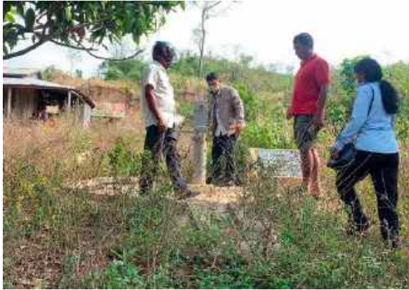
Well before fixed