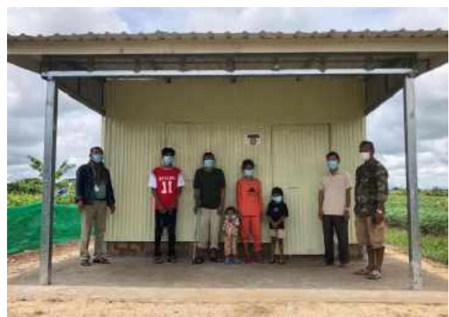
Their new house, supported by CFS