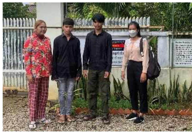
Children and their family access to Pailin Family Center

Below, here are some pictures of CFS staff contacts other NGOs for referring vulnerable women and children that CFS cannot offering them assistance. Some orphan children needs long-terms placement/or orphanage center.