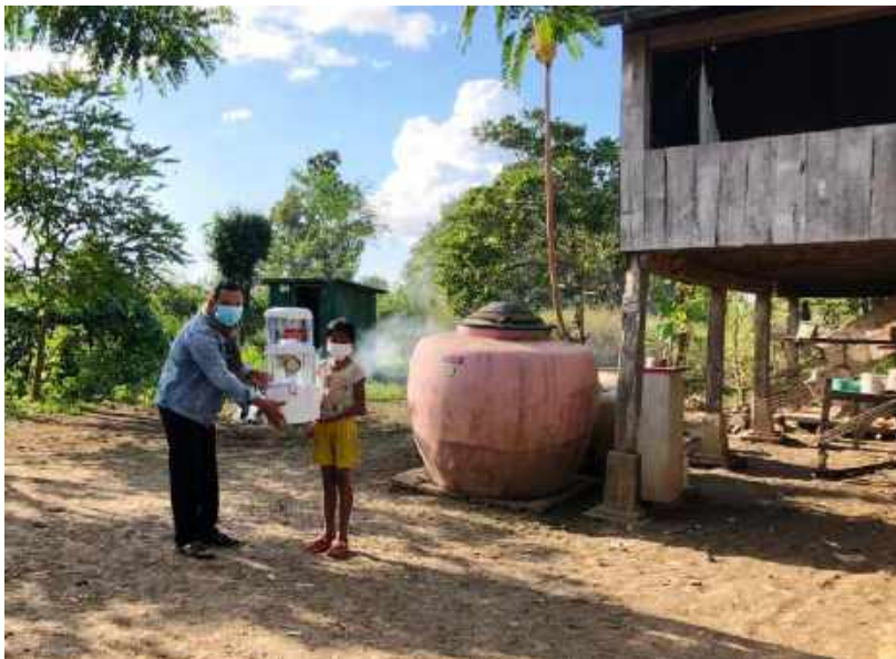
We gave them a water filter as a reward to keep their house environment clean