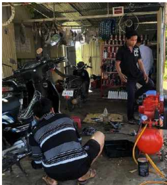
Micro-business for generating income, supported by CFS