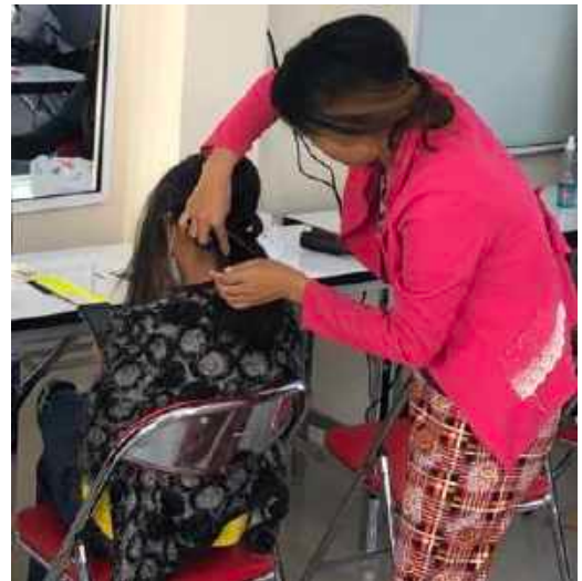
A poor girl has been sending and learning skill, provided by other NGOs