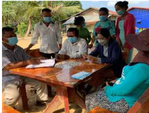
SHG meeting and Monitoring