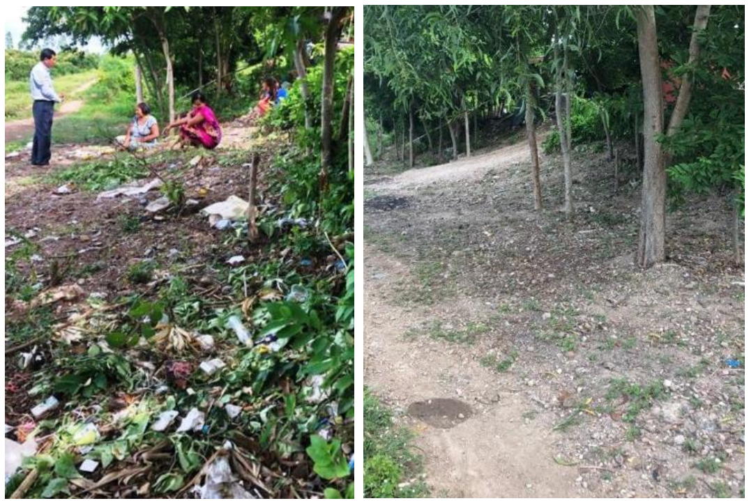
Household sanitation committed by HHP project