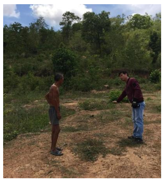
CFS assess the place where they should build their latrine

With supported by HHP funding project, From Jan to Aug 2019, there are 133 private latrines were completely built with participation of helping each other among self help group members. Amount those, there are 35 private toilet built in Rattanak Mondul, 38 in Kamrieng and another 60 in Pailin.