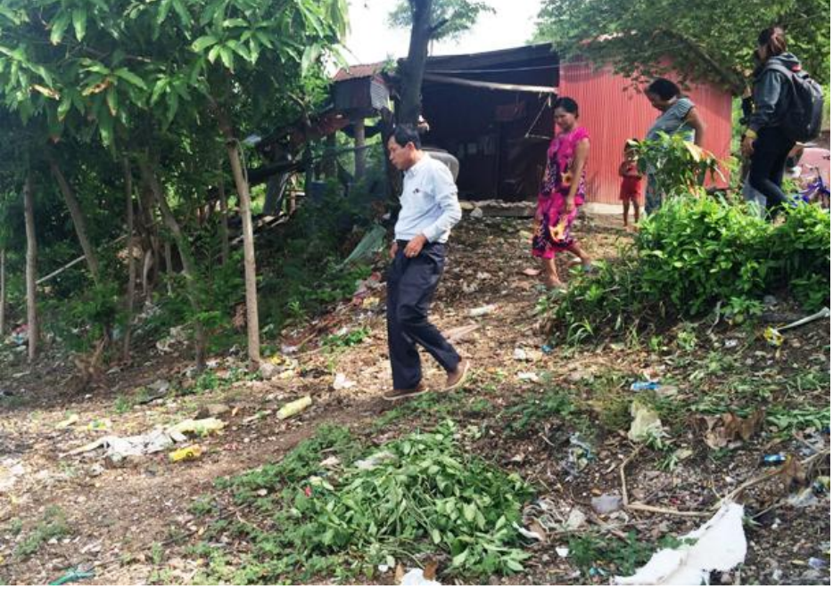
Unclean household has changed as another picture below