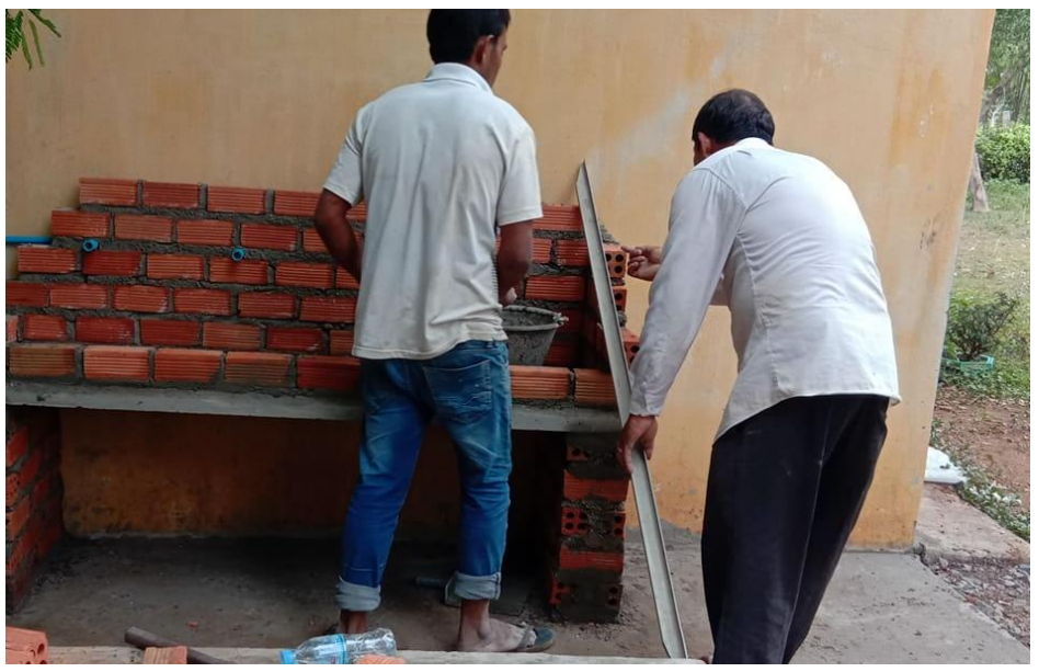
Process of Building