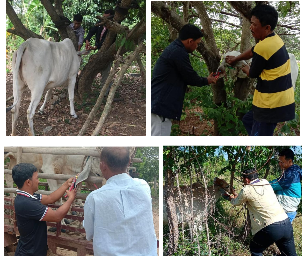
Calves ear tagged before giving to families