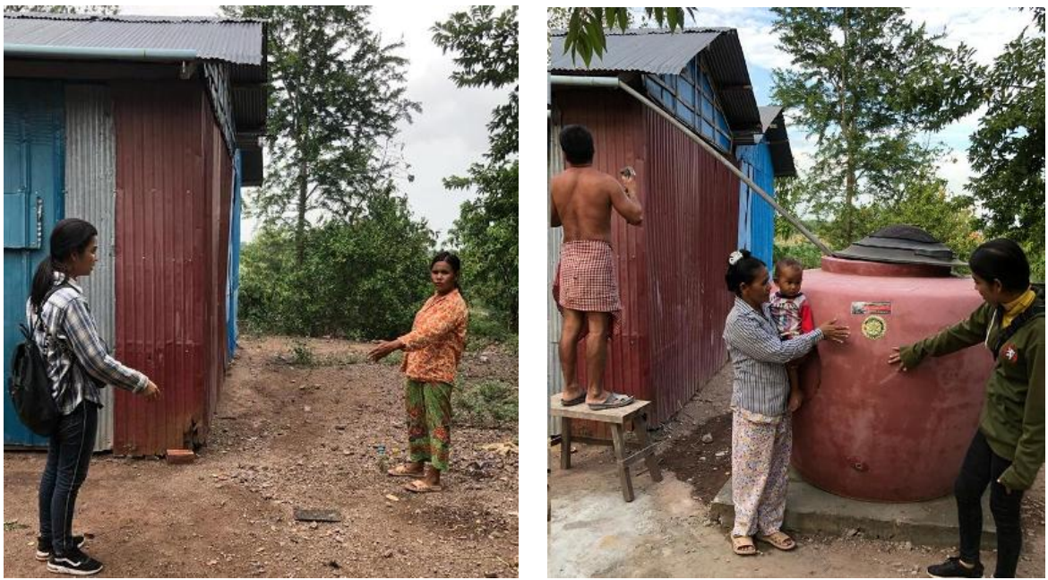
Water jar is given family

It is to report that, from Jan-Aug 2019, there are 103 water jars (41 water filters were given to families in Rattanak Mondul, 7 water filers were given to families in Kamrieng and another 55 were provision families in Pailin self help group. Each of family has received one.