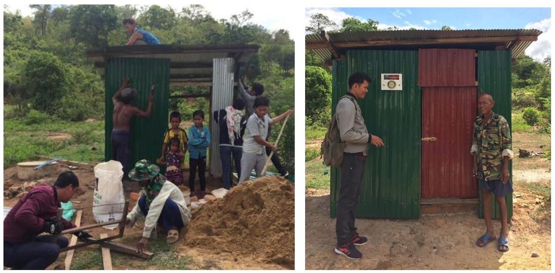
Self help group member helped each other to build their latrines

As usual practices, CFS staff has assessed the place where latrines should be build according to Ministry of rural development advised.