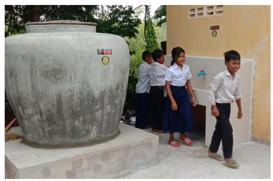
Handwashing completely built and used by school children