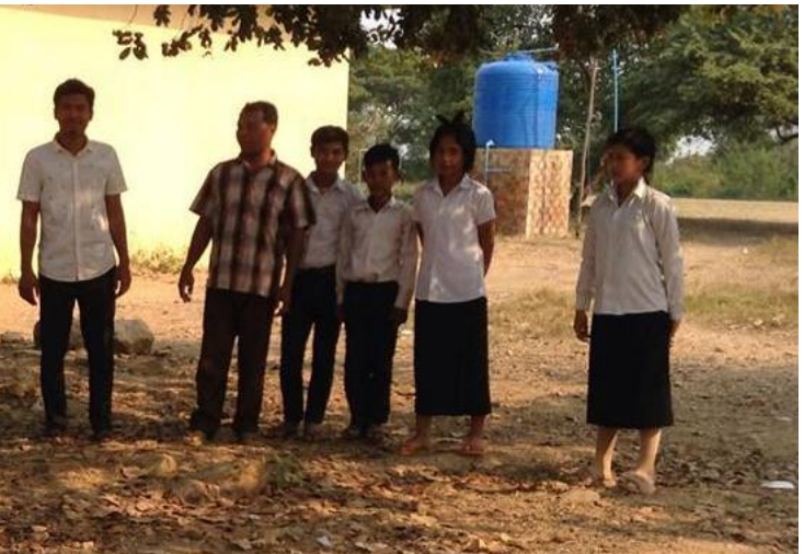
Visited location before building

It is to report that there are two school handwashing were completely built during the reporting period, a handwashing was built in Rattanak Mondul and another was build in Pailin.