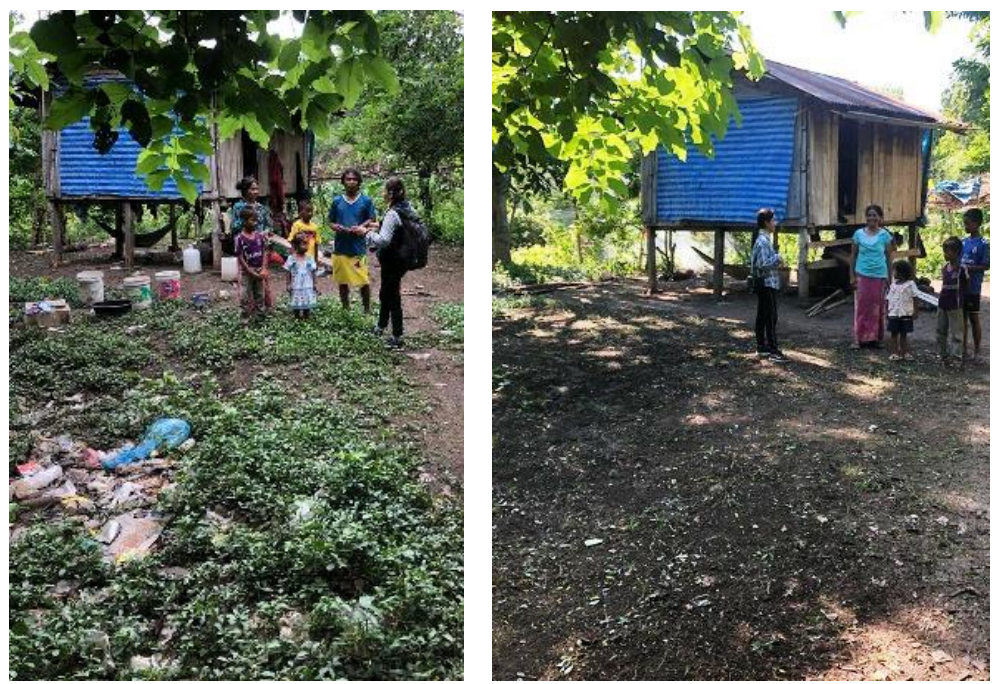
Rural people change their harmful practice to live with clean household environment