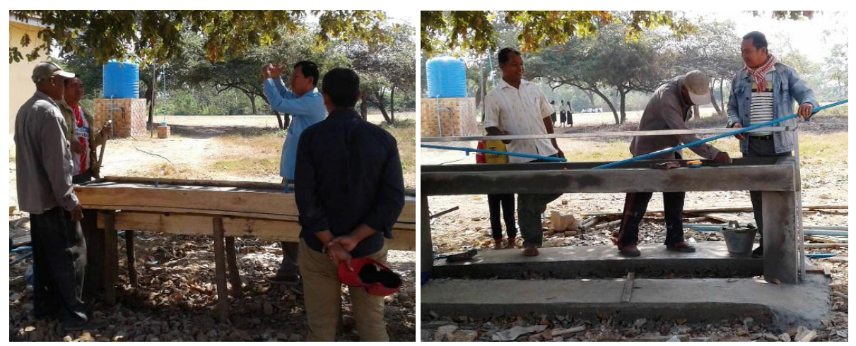
CFS visited the process of building