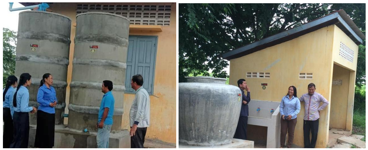
Water storage for handwashing