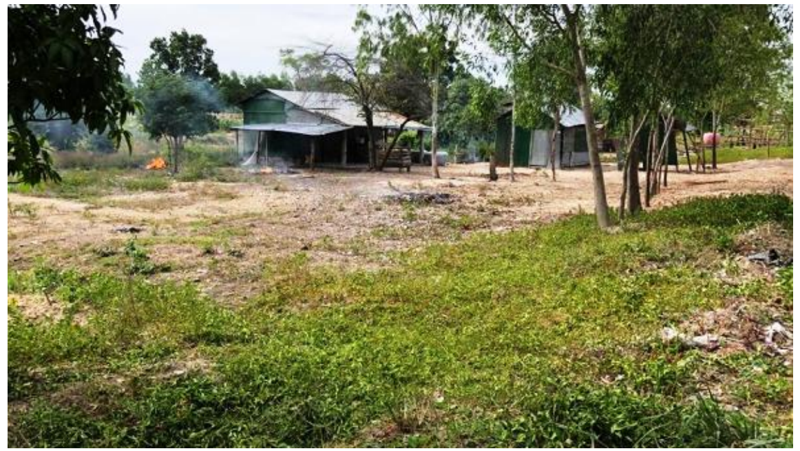
Our rural poor helping each other to clean their community