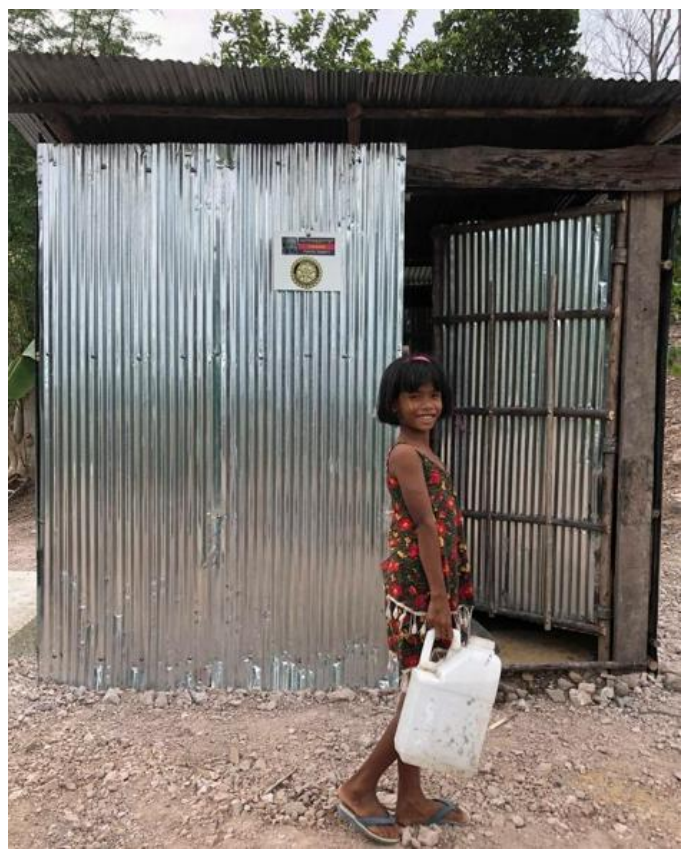
CFS teaches community children how to proper uses their latrines