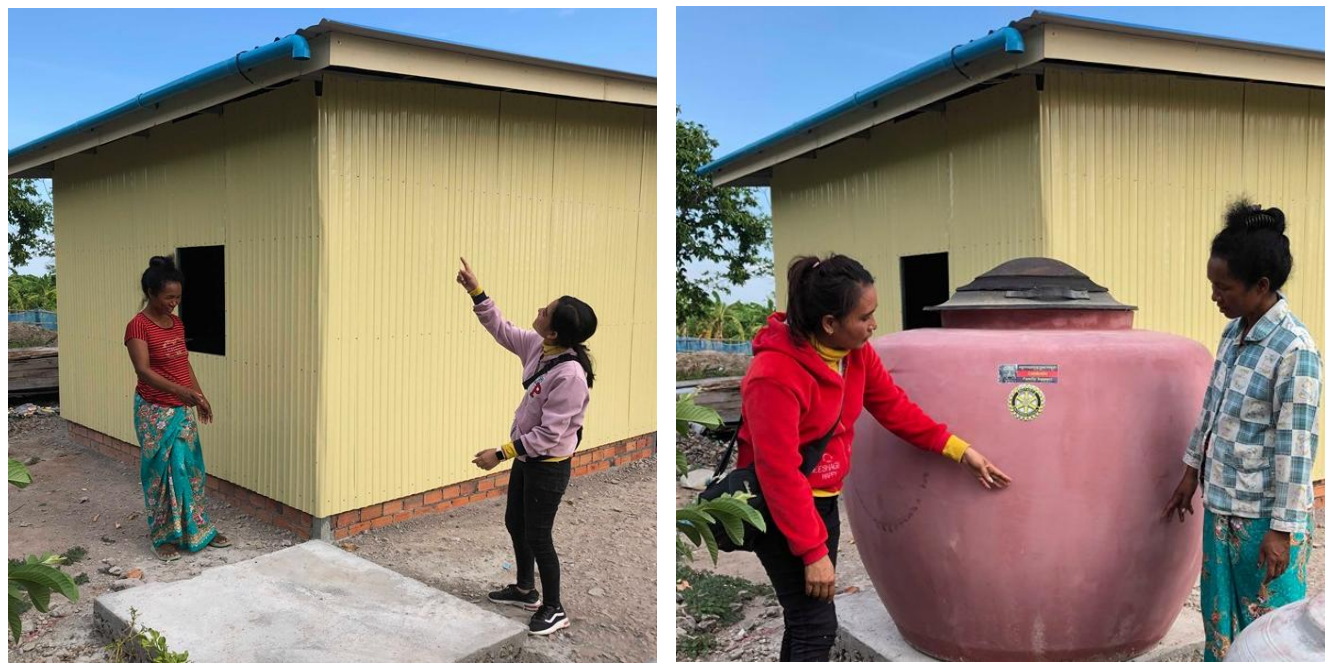
Jar installed for the poor who is in SHG, before and after