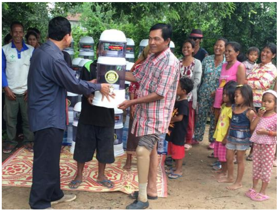
Director of CFS gave a water filter a landmine survivor who is in SHG