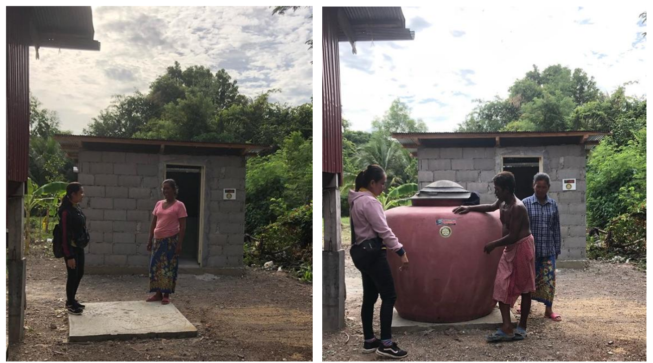
Jar installed for the poor who is in SHG, before and after