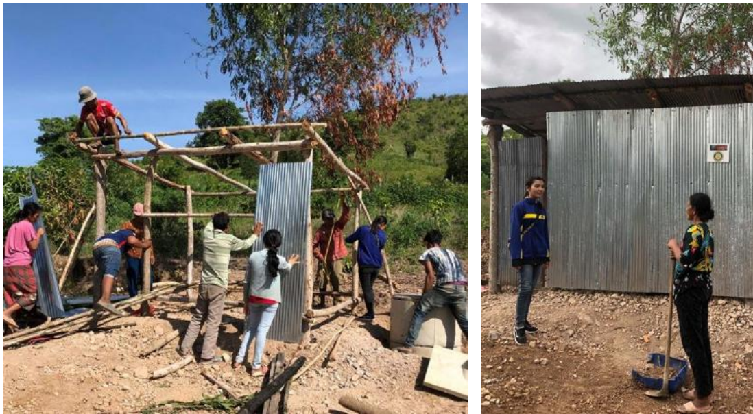
They help each other