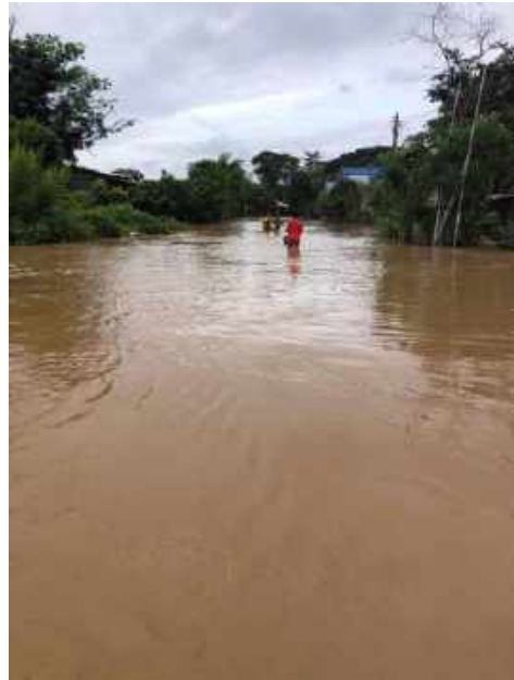
Flood conditions (early 2023) in CFS implementation area-Photo by CFS-2023)

Approximately 80% of total Cambodian are living in rural areas. They are mostly dependent for survival on agriculture production. The inadequate quantity and quality of water in most of the area where CFS works impacts greatly on both the livelihood and the health of the rural poor.