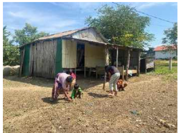
Director of CFS teaches villagers the importance of keeping a clean living environment

On behalf of rural poor family and my staff, I am deeply honored to receiving your all supported. My profound thanks and gratitude go out to those who supported this project, especially for The Rotary Club of Western Endeavour (PERTH AUSTRALIA) FOR SUPPORTING CFS!