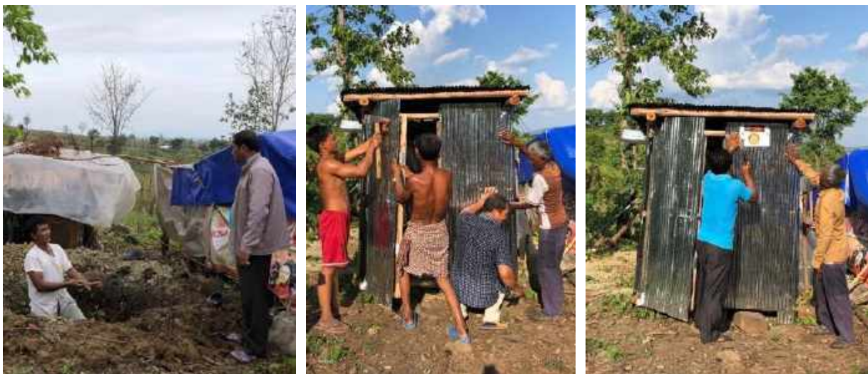
Family and self-help group members are helping together to build their latrines