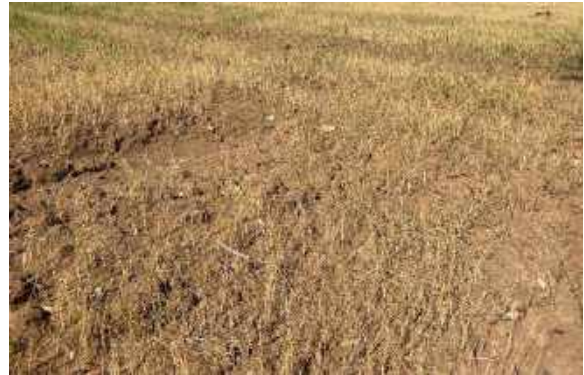
Drought conditions June 2023 in CFS implementation area